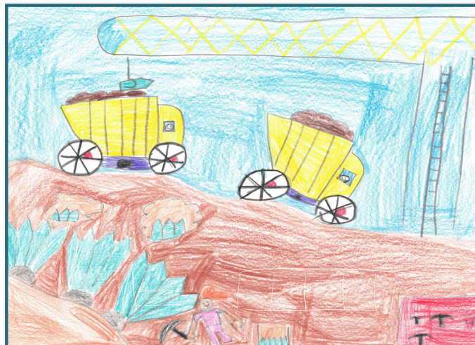
2021-2022 Rockhound artwork by grade 4/5 student from École Rochester Elementary School in Coquitlam.

Keep an eye out for our monthly e-updates and follow us on social media for updates on all our programs and our 2022 Pro-D Day workshops.